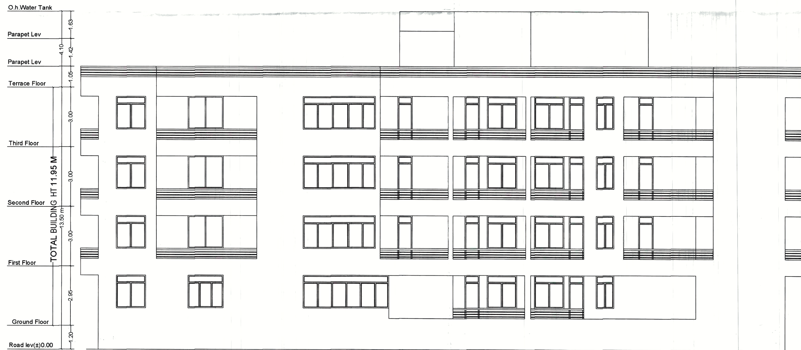
Left Side Elevation Block-B Scale = 1:100