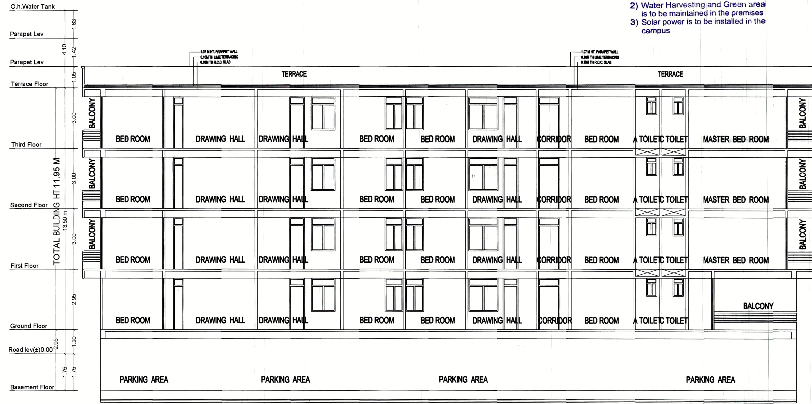
Section Y-Y Block-B Scale = 1:100