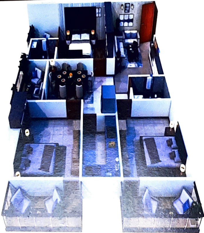
1 st FLAT NO-1 (3 BHK+2T) CARPET 890.00 Sft. BALCONY 178.00 Sft.