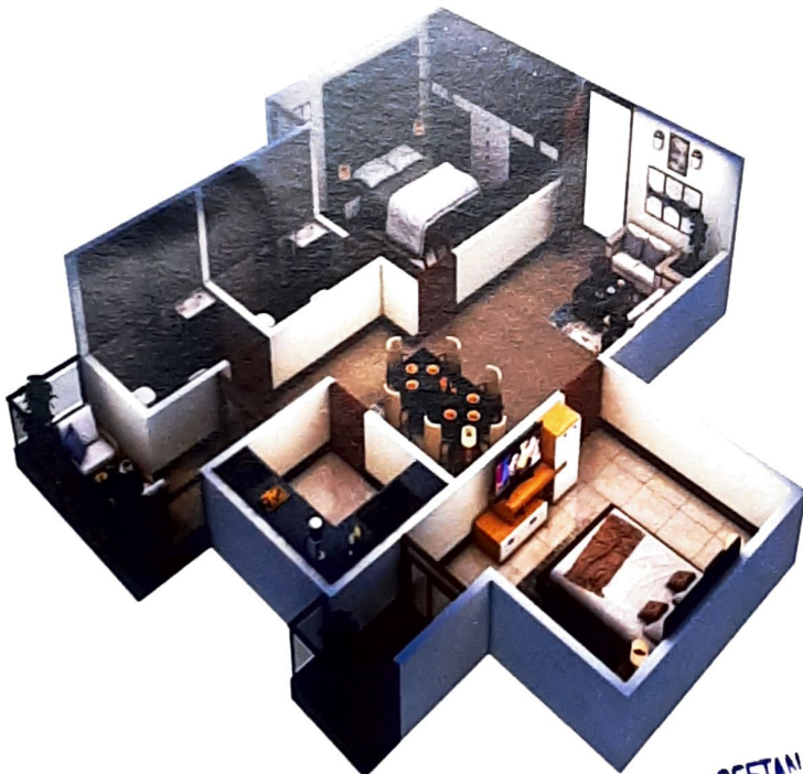
3 rd FLAT NO - 3 (2BHK = 2T) CARPET 680.00 Sft. BALCONY 85.00 Sft.