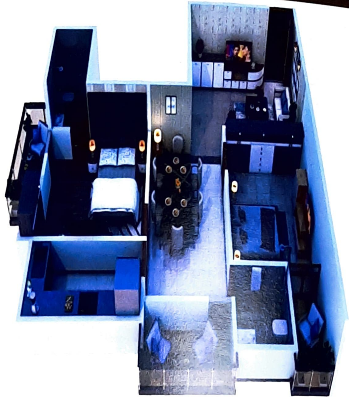
2 nd AREA CARPET 738.00 Sft. BALCONY 116.00 Sft.