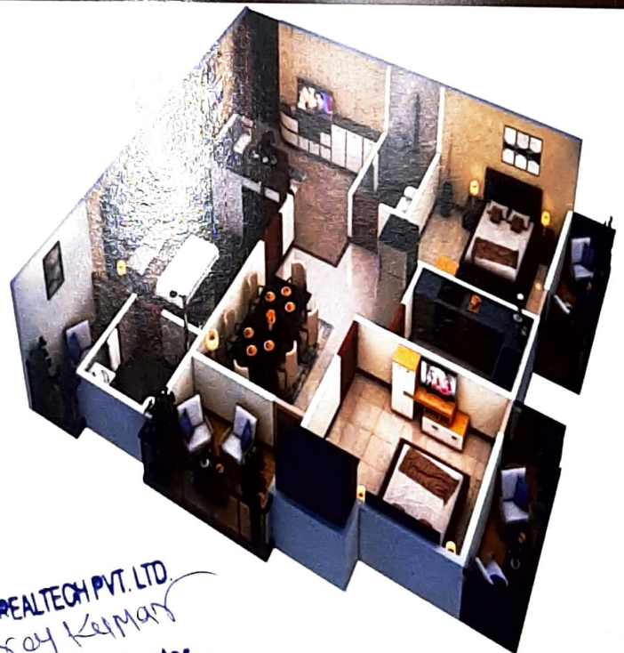
4 th FLAT NO - 4 (3BHK + 2T) CARPET 894.00 Sft. BALCONY 171.00 Sft.

GEETANJALI REALTECH PVT. LTD. No. 55, Jay Keyway Dombivli