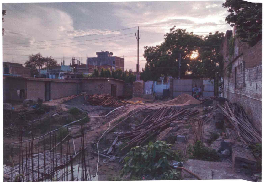
Project Name - KISHORI JAGDISH APARTMENT