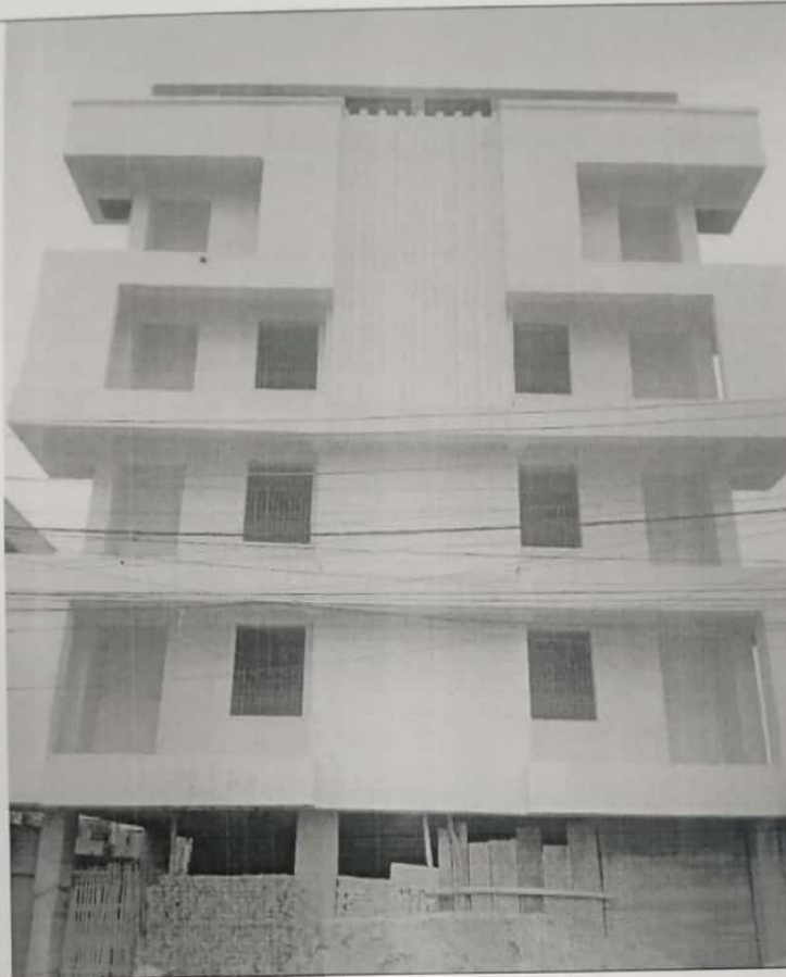
2. Rear Elevation